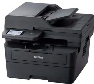
Brother Industries (A4/Monochrome) MFC-L2880DW