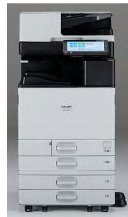
Ricoh (A3/Color) RICOH IM C7010