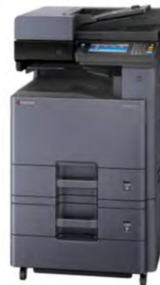
Kyocera DS (A3/Color) TASKalfa 2470ci+