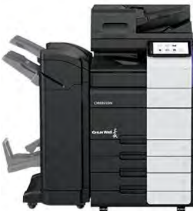
GWI China (A3/Color) CM8055DN