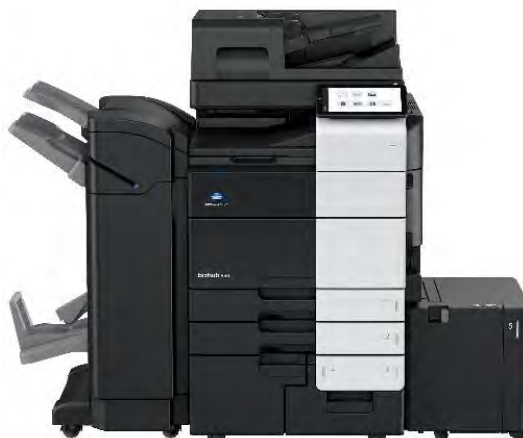
Konica Minolta China (A3+/Monochrome) bizhub 950i