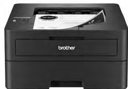
Brother Industries US (A4/Monochrome) HL-L2460DW