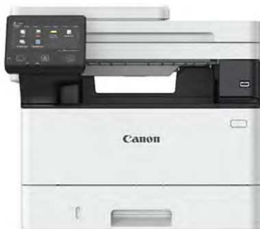
Canon US (A4/Monochrome) imageCLASS X MF1440