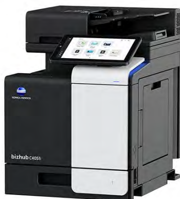
Konica Minolta (A4/Color) bizhub C4051i