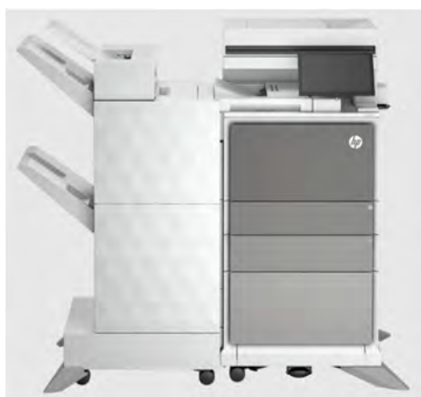
HP China (A4/Color) HP Color LaserJet Enterprise Flow MFP 6800zfw+