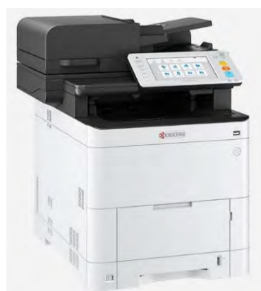
Kyocera Document Solutions US (A4/Color) ECOSYS MA4000cifx