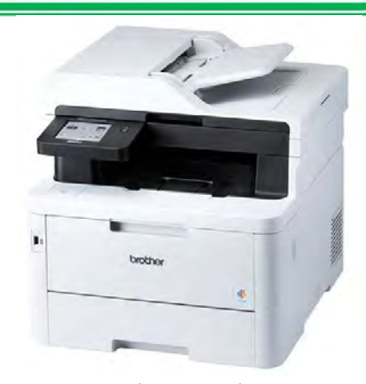
Brother Industries (A4/Color) MFC-L3780CDW