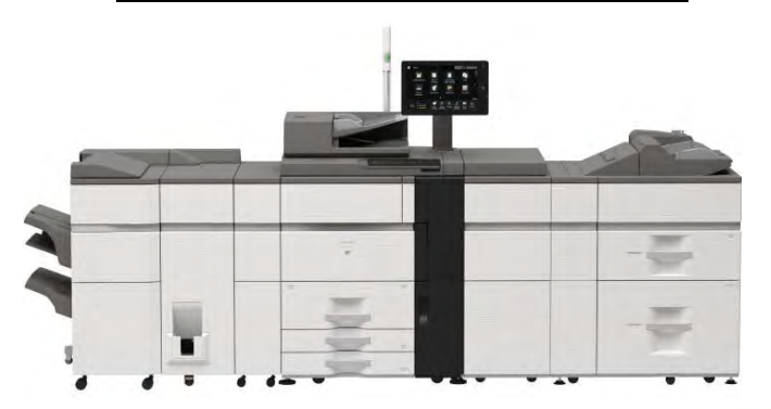
Sharp US (A3+/Color) BP-90C80