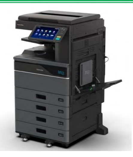
Toshiba TEC (A3/Color) e-STUDIO4525AC RFID