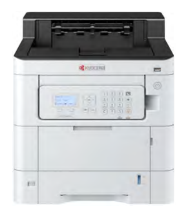
Kyocera Document Solutions (A4/Color) ECOSYS PA4500cx