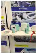
<Compact Label Printer>

Sample Page Excerpt from "Other News" 2. ISOT (International Stationery & Office Products Fair) 1) ZHUHAI ELMER TECHNOLOGY ZHUHAI ELMER TECHNOLOGY is a Chinese label printer manufacturer established in 2013. It is known for its AIMO brand. The company's total sales of label printers in 2022 exceeded one million units (including small types and A4 support types together). The latest A4 mobile transfer printer, the PS31, costs around 1,000 yuan, and the paper size can be adjusted with a lever inside.