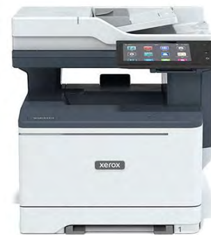
Xerox (A4/Color) VersaLink C415