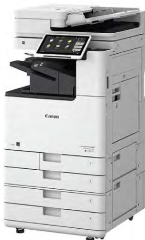
Canon (A3/Color) imageRUNNER ADVANCE DX C3935F