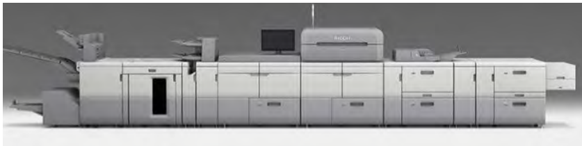
Ricoh (A3+/Color) RICOH Pro C9500