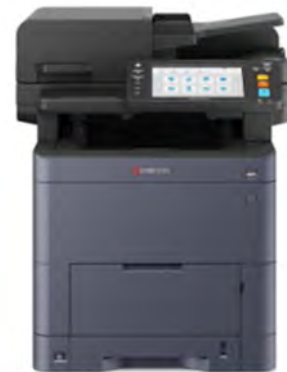
Kyocera Document Solutions (A4/Color) TASKalfa MA3500ci