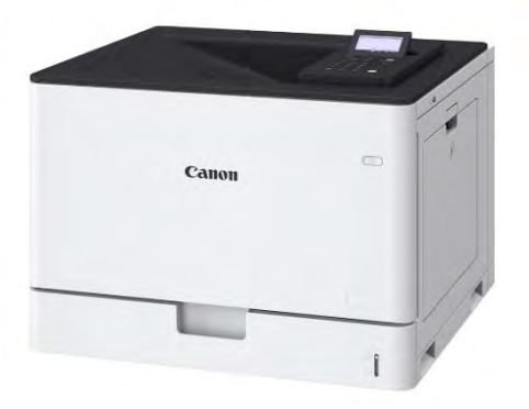
Canon (A3/Color) Satera LBP863Ci