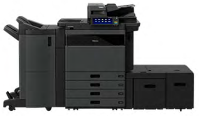
Toshiba TEC (A3/Color) e-STUDIO7527AC