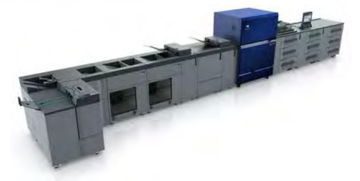
Konica Minolta Europe (A3+/Color) AccurioPress C14000e