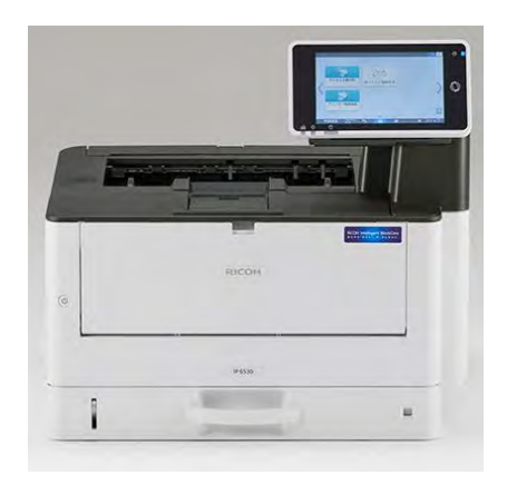
Ricoh (A3/Monochrome) RICOH IP 6530 series