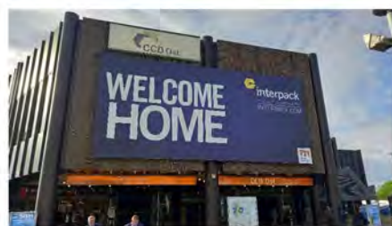
Entrance to the venue