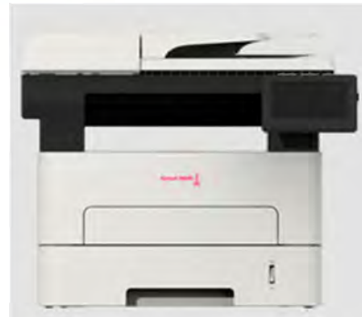
China GreatWall (A4/Monochrome) GBM-B301X