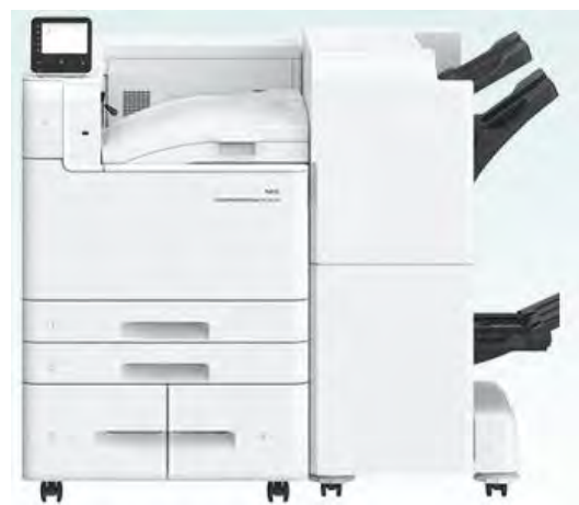
NEC (A3/Color) Color MultiWriter 3C751A