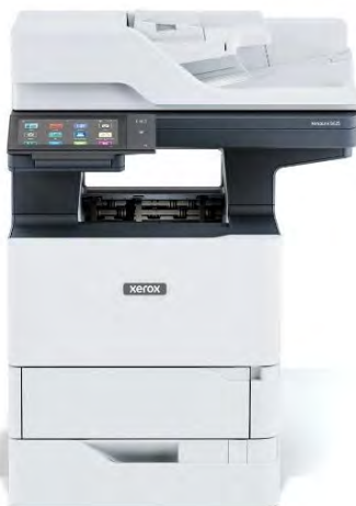
Xerox (A4/Monochrome) VersaLink B625