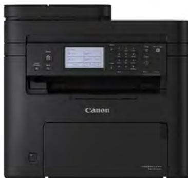
Canon India (A4/Monochrome) imageCLASS MF274dn