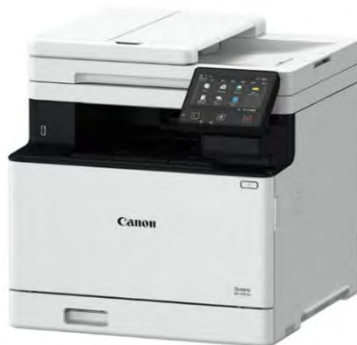
Canon (A4/Color) Satera MF755Cdw