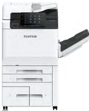
Fujifilm Business Innovation (A3/Monochrome) Apeos 7580