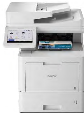
Brother Industries US (A4/Color) MFC-EX670W