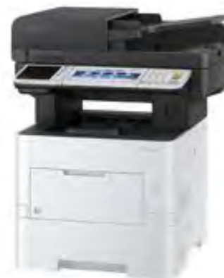
Kyocera Document Solutions (A4/Monochrome) ECOSYS MA4500ifx