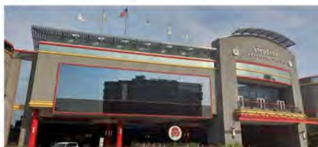
Donald E Stephens Convention Center