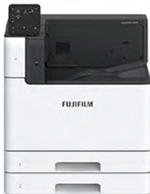
Fujifilm BI (A3/Color) ApeosPrint C5570