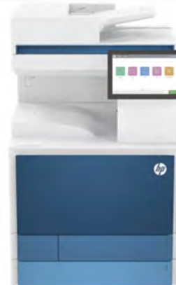
HP (A3/Color) Color LaserJet Managed MFP E877 series