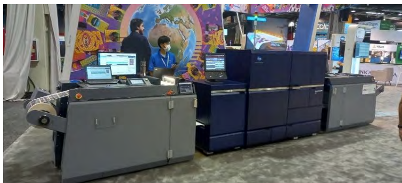
AccurioLabel 400 (Konica Minolta Business Solutions: U.S.A.) (from Labelexpo Americas 2022)