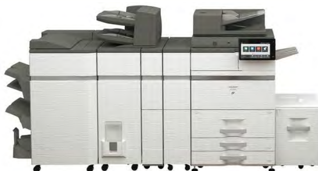
Sharp (A3/Monochrome) BP-70M90