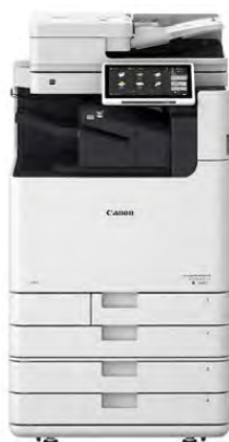
Canon China (A3/Monochrome) iR-ADV DX 2735