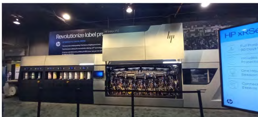
HP Indigo V12 Digital Press (from Labelexpo Americas 2022)