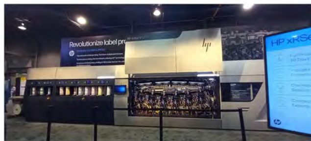
HP Indigo V12