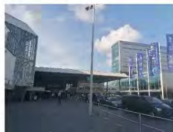
<RAI Amsterdam Convention Center>

FESPA 2021 (officially called: FESPA Global Print Expo 2021) was held in Amsterdam, the Netherlands for four days from October 12 (Tuesday) to 15 (Friday).