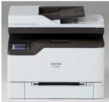
Ricoh (A4/Color) RICOH P C200SFL