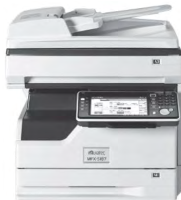
Muratec (A3/Monochrome) MFX-5187