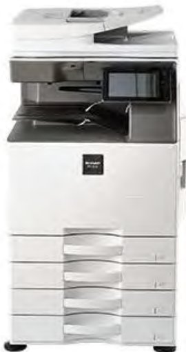
Sharp China (A3/Color) MX-C2622R