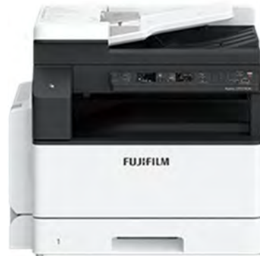
FUJIFILM Business Innovation China (A3/Monochrome) Apeos 2350 NDA