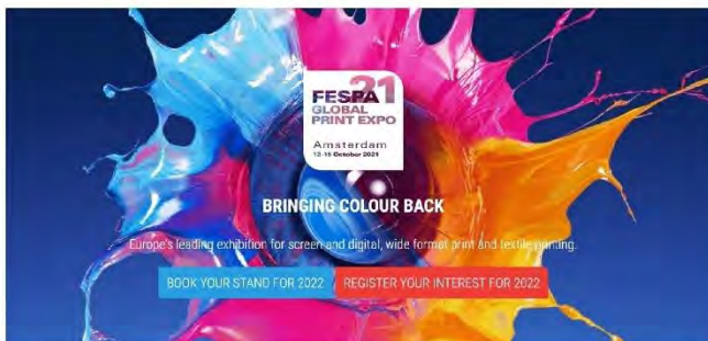
<Main image of FESPA 2021>

The cover story of the month will report major makers' exhibits at the show. The on-site report was provided by our partner company, i4 inkjet Ltd, based in Ireland.