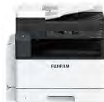
Apeos 2350 NDA