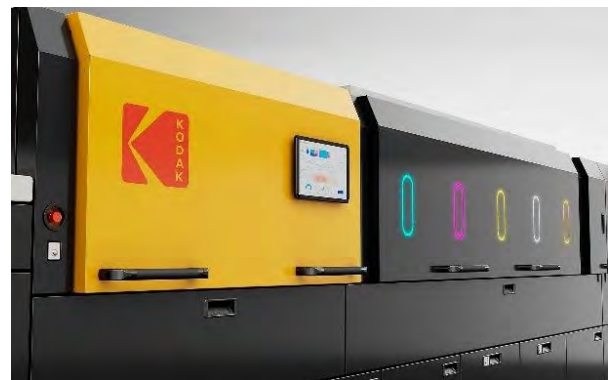
Kodak US (356mm × 1219mm/Color) KODAK ASCEND Digital Press