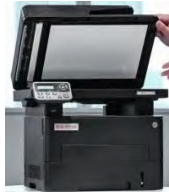
Aurora China (A4/Monochrome) AD338MNA