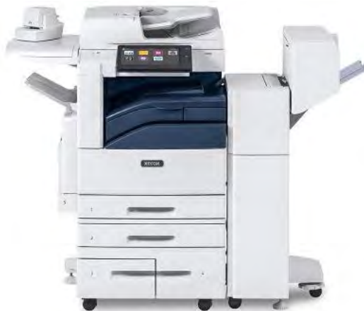
Xerox Corp. (A3/Color) EC8056