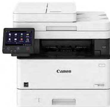
Canon US (A4/Monochrome) imageCLASS MF455dw