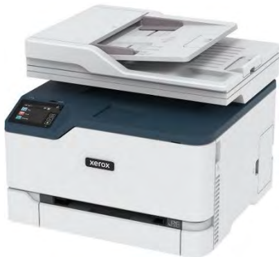
Xerox Europe (A4/Color) C235 Colour Multifunction Printer