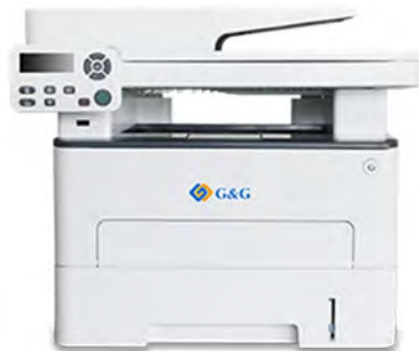
G&G China (A4/Monochrome) L2550DW