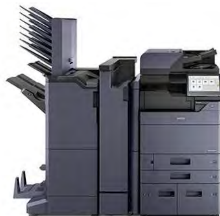
Kyocera Document Solutions (A3/Color) TASKalfa 7054ci