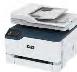
C235 Colour Multifunction Printer