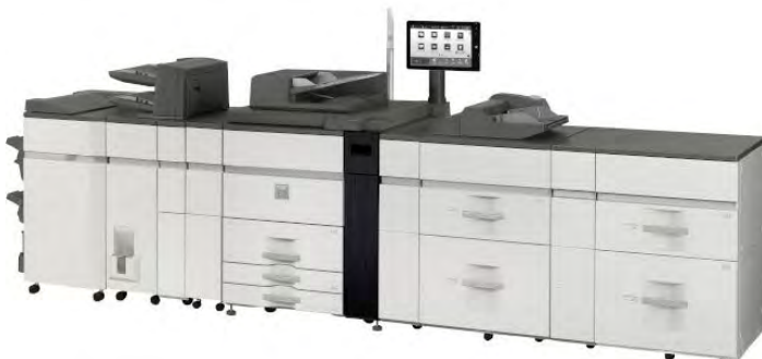
Sharp (A3+/Monochrome) MX-M1206