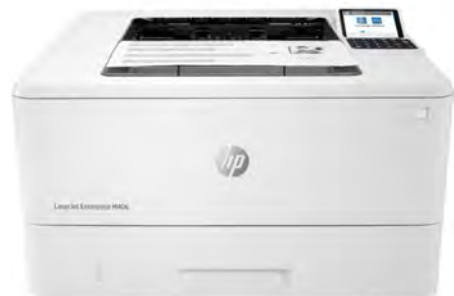
HP Europe (A4/Monochrome) LaserJet Enterprise M406dn