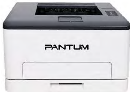
Pantum India (A4/Color) CP1100