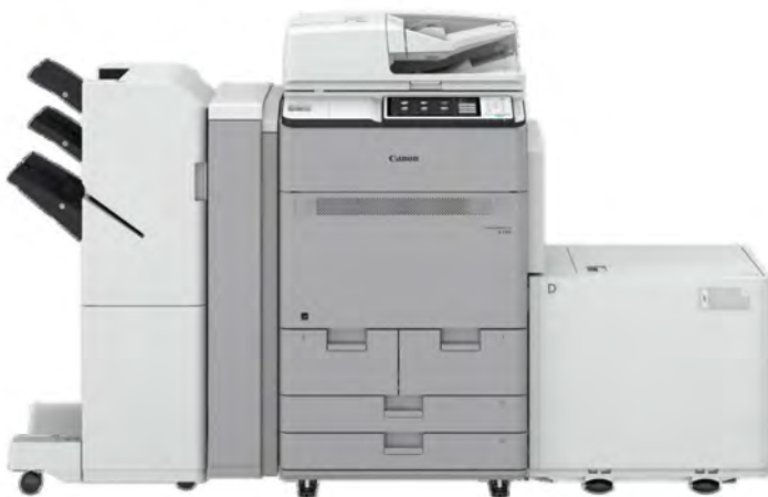
Canon (A3+/Color) imagePRESS C170