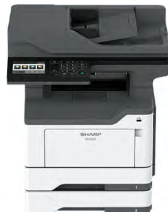
Sharp US (A4/Monochrome) MX-B467F